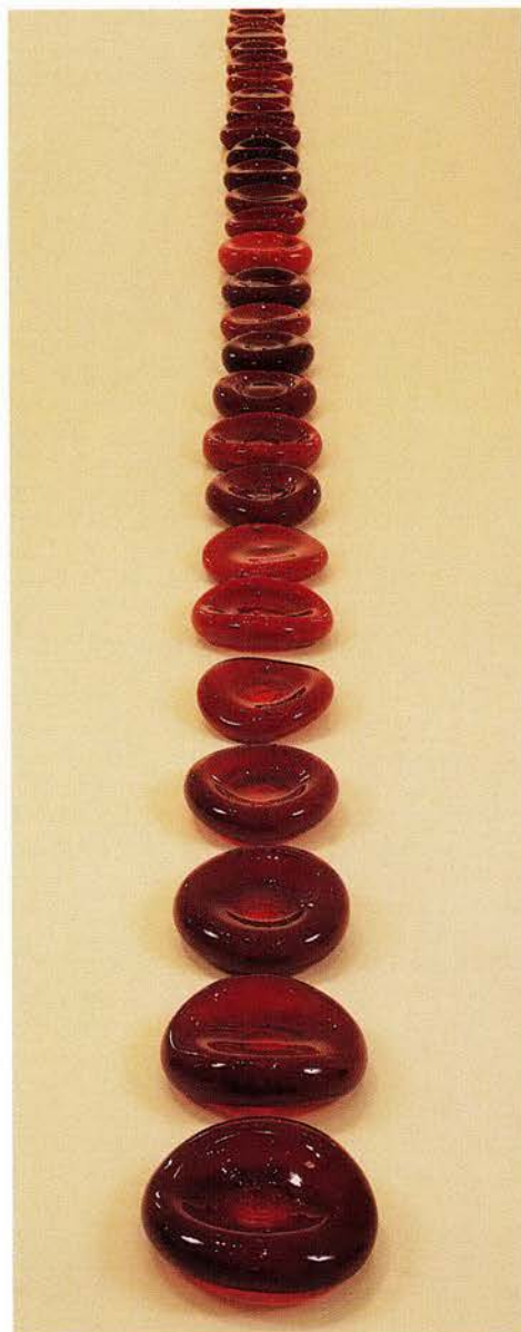
Smith: Bloodline, 1994, 100 units of blown glass, each unit approx. 8 inches in diameter, overall dimensions variable.

Serrano's interest in the transfiguration of the subject is most clearly revealed in his series called