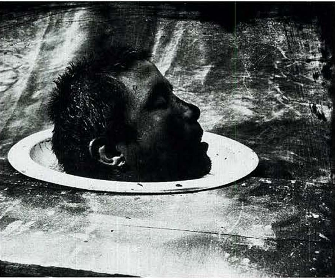
Wilkin: Head of a Dead Man, Mexico, 1990, gelatin silver print with encrustation, 25 1/4 by 32 1/4 inches.

Catholicism's female mystics also offers an alternative to more recent feminist stances which assert that gender is simply a construct and that representations of the female body are merely reinforcements of patriarchal power. Such notions dissuaded a generation of theoretically inclined women artists from considering the body as a source of knowledge and meaning. The work of Kiki Smith provides an example of a woman artist who has found a middle way between these two extremes. Not surprisingly, one of her sources is Catholicism.