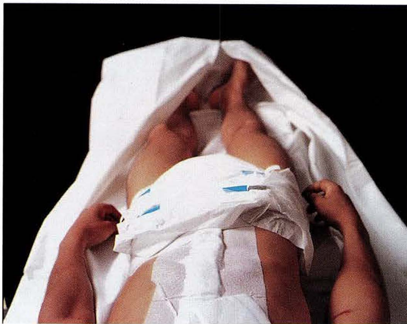
Serrano: The Morgue (Gun Murder), 1992, Cibachrome print mounted on Plexiglas, 49 1/4 by 60 inches.

For certain contemporary women artists, Catholicism's vision of continuity between the corporeal and the divine seems to offer an alternative to '70s-style feminism with its insistence on what now seems a false dichotomy between female and male, body and mind, nature and culture. The legacy of